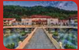
The Lalit Grand Palace Srinagar