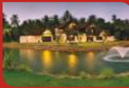
The Lalit Resort & Spa Bekal (Kerala)