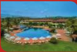
The Lalit Golf & Spa Resort Goa