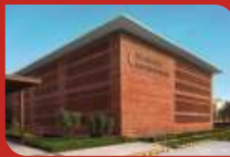
The Lalit Suri Hospitality School Faridabad