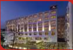
The Lalit Great Eastern Kolkata