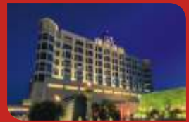
The Lalit Jaipur