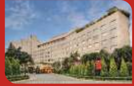
The Lalit Ashok Bangalore