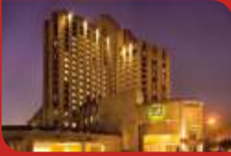
The Lalit New Delhi