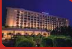
The Lalit Mumbai