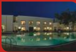
The Lalit Temple View Khajuraho