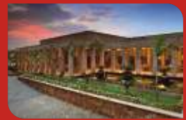
The Lalit Mangar