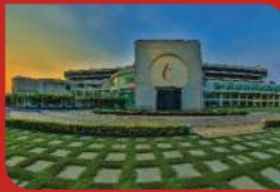
The Lalit Chandigarh