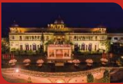
The Lalit Laxmi Vilas Palace Udaipur