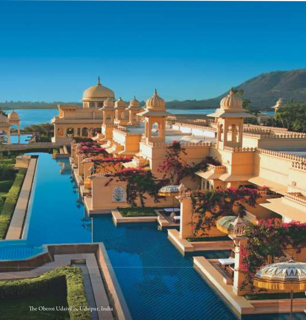
The Oberoi Udaivilas, Udaipur, India

Wherever you find us, you will find the heart of Oberoi. Discover some of the world's most fascinating destinations, experience our unrivalled locations and architecture that captures the essence of the locale. All complemented by the sincere, caring service, that is famously Oberoi. Heart. Felt.