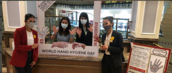
Director of Human Resources & the Human Resources Team