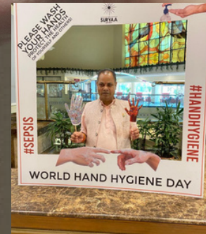
Vice President Operations