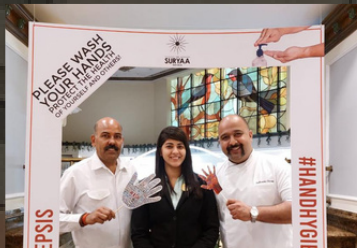
Director of Engineering Hygiene Manager & Executive Chef