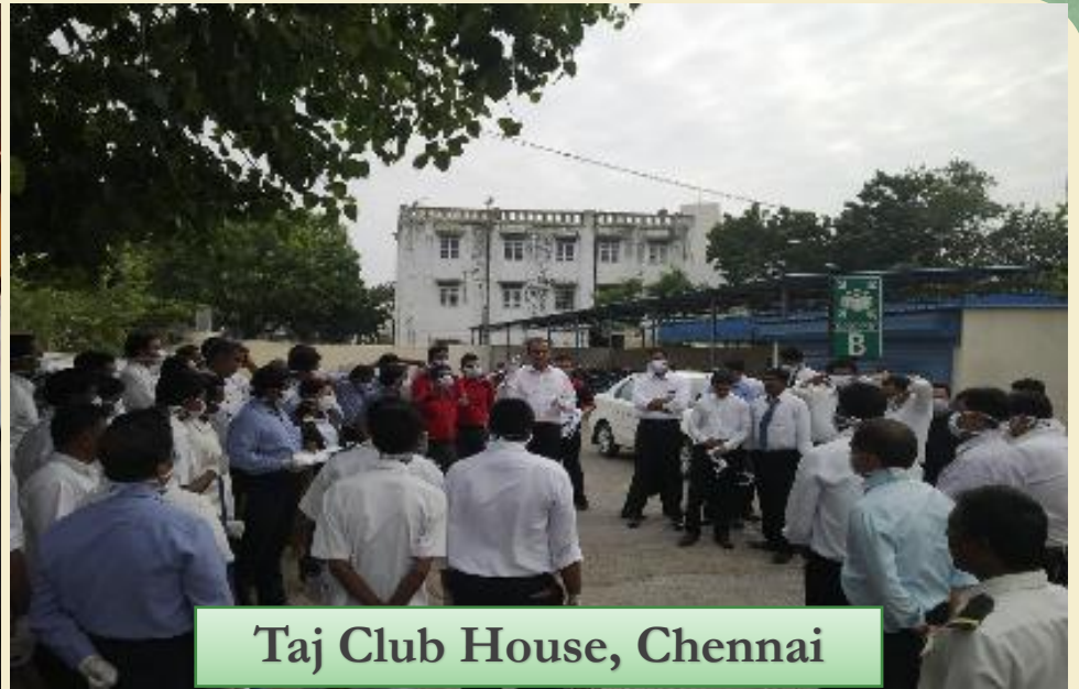
Taj Club House, Chennai