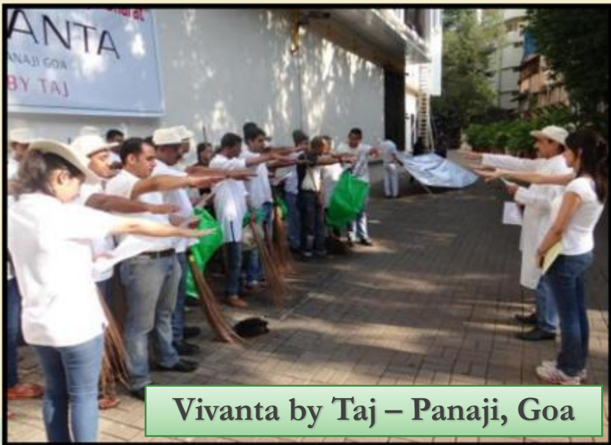
Vivanta by Taj – Panaji, Goa

All associates began the Clean India Campaign with a pledge