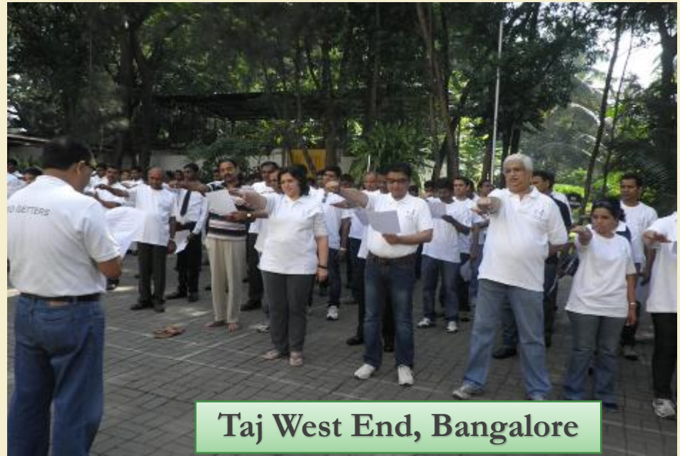
Taj West End, Bangalore