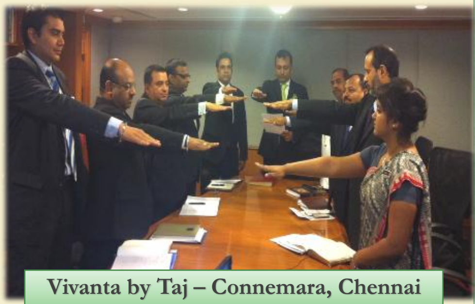
Vivanta by Taj – Connemara, Chennai