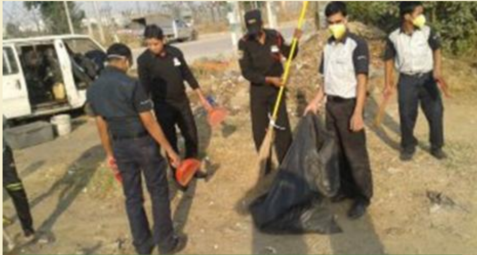
Ginger Hotel, Manesar