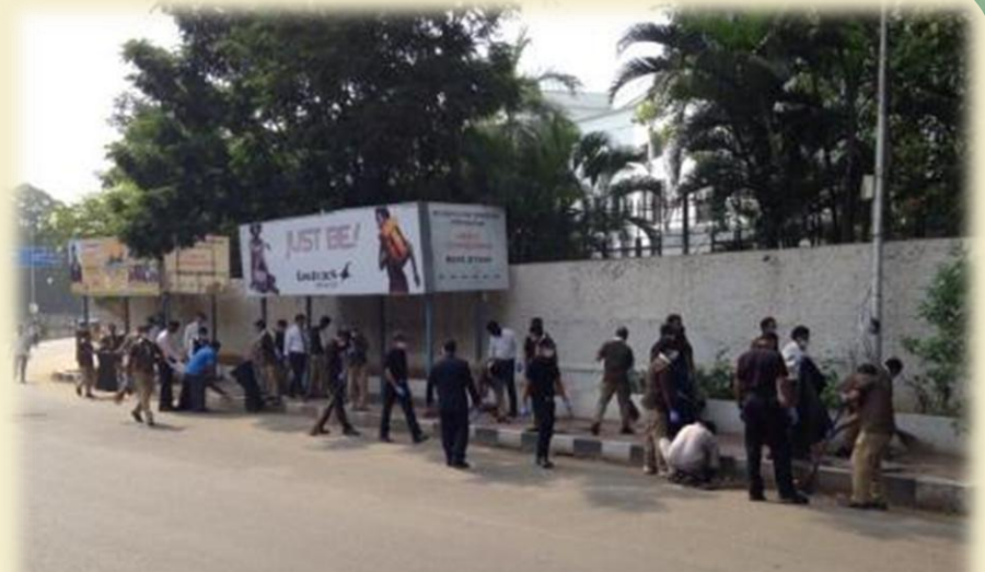
Vivanta by Taj – Connemara, Chennai