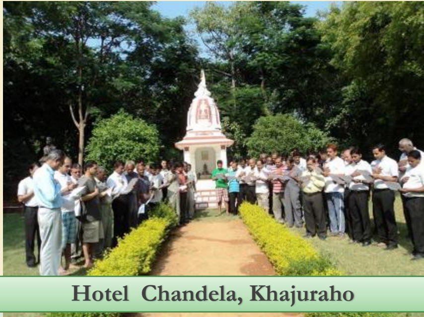
Hotel Chandela, Khajuraho