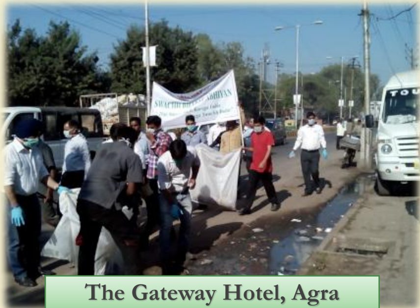
The Gateway Hotel, Agra