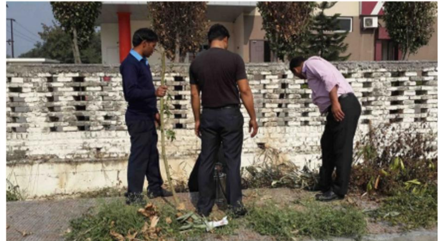
Ginger Hotel, Pantnagar