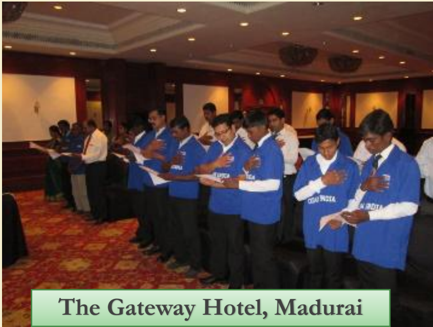
The Gateway Hotel, Madurai