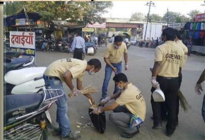
Vivanta by Taj – Yeshwantpur, Bangalore