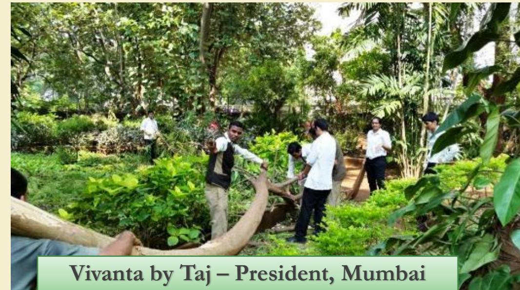
Vivanta by Taj – President, Mumbai