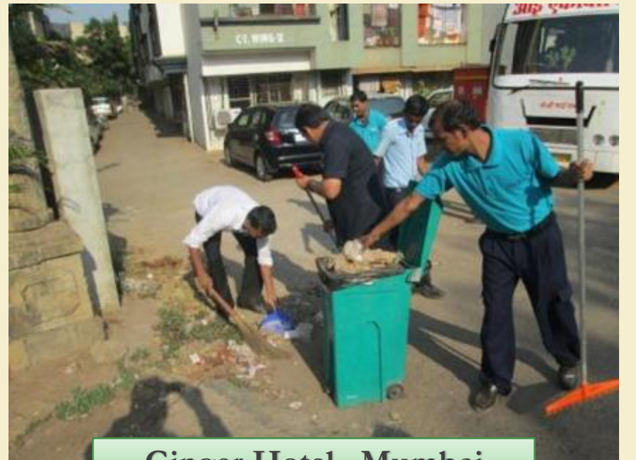
Ginger Hotel, Mumbai