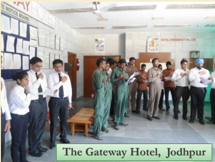
The Gateway Hotel, Jodhpur