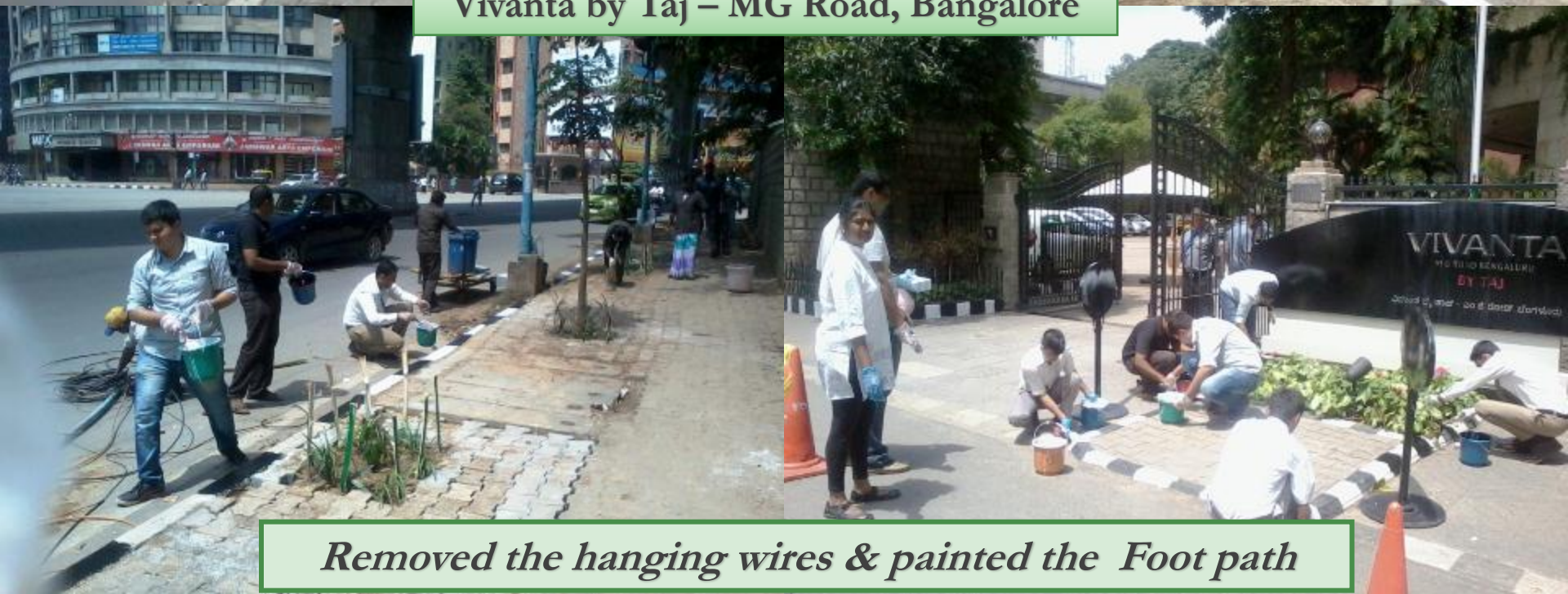
Removed the hanging wires & painted the Foot path