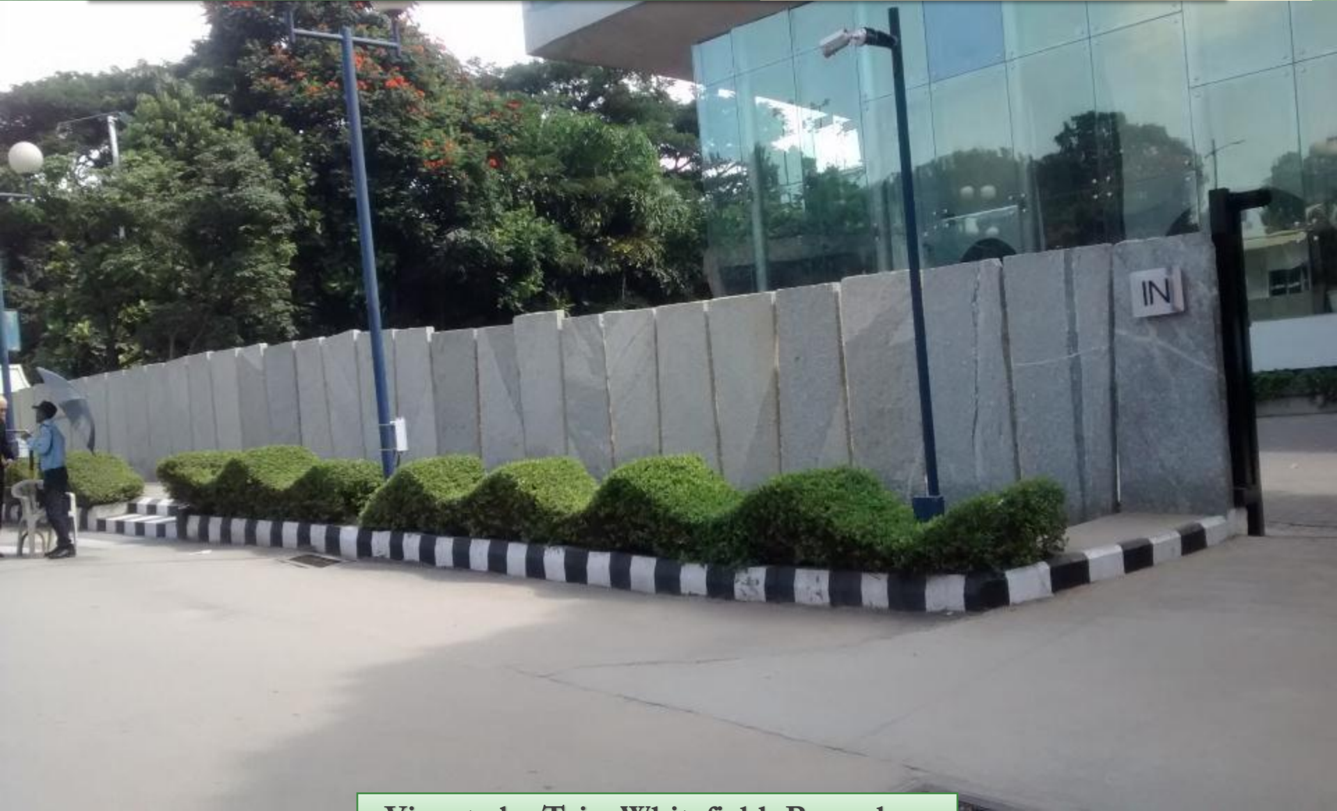
Vivanta by Taj – Whitefield, Bangalore