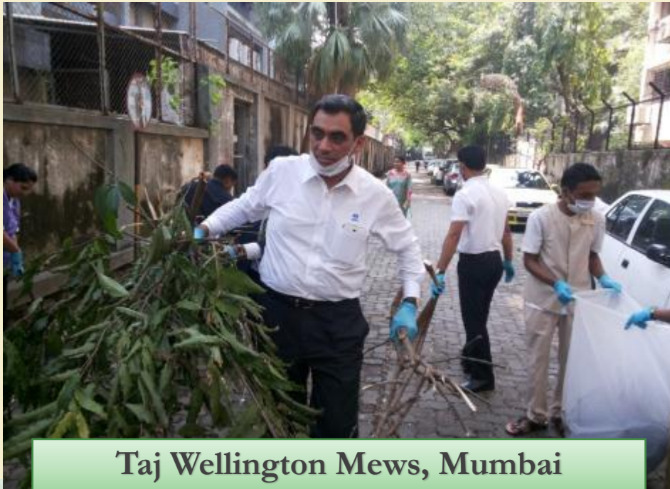
Taj Wellington Mews, Mumbai