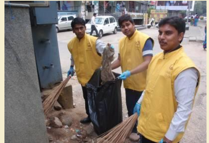
The Gateway Hotel, Bangalore