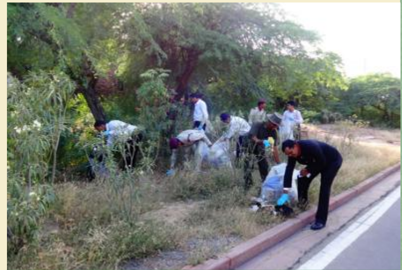
Umaid Bhawan Palace, Hyderabad