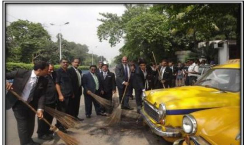
Taj Bengal, Kolkata