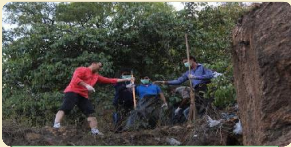
Falaknuma Palace, Hyderabad