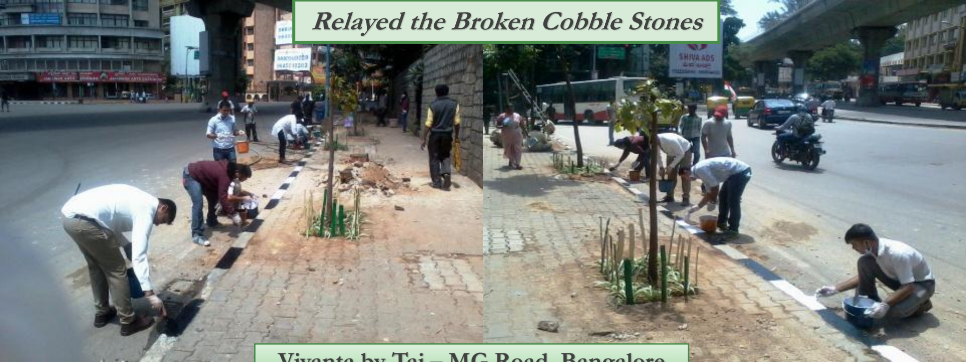
Vivanta by Taj – MG Road, Bangalore