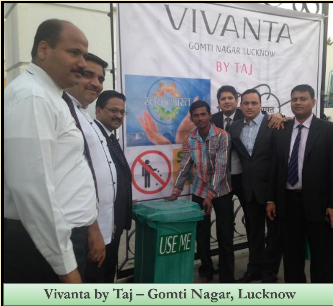
Vivanta by Taj – Gomti Nagar, Lucknow

As a community gesture, a used garbage bin is being handed over to a local tea stall owner. He has been asked to dispose all his garbage in this bin which was earlier being thrown on the road adjacent to the hotel.