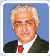
Mr. Nakul Anand President, Hotel Association of India & Executive Director, ITC Limited