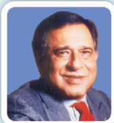
Mr. P.R.S. Oberoi Corporate Member Chairman & Chief Executive EIH Limited